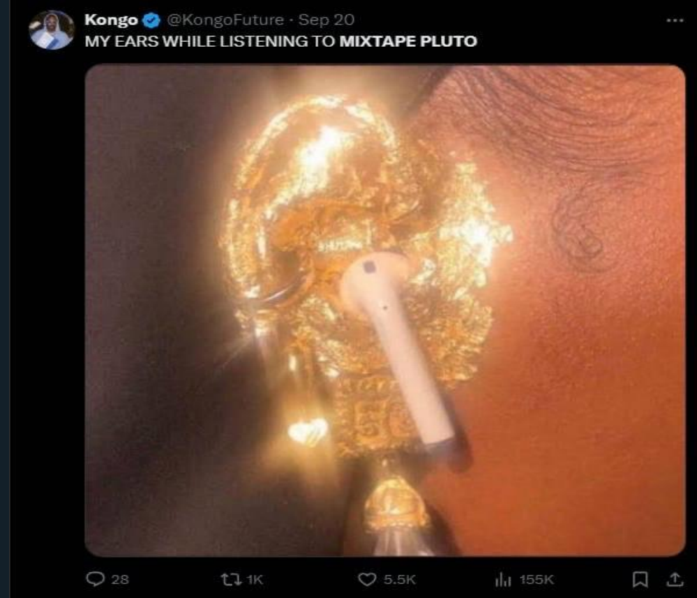
this how future got me rn